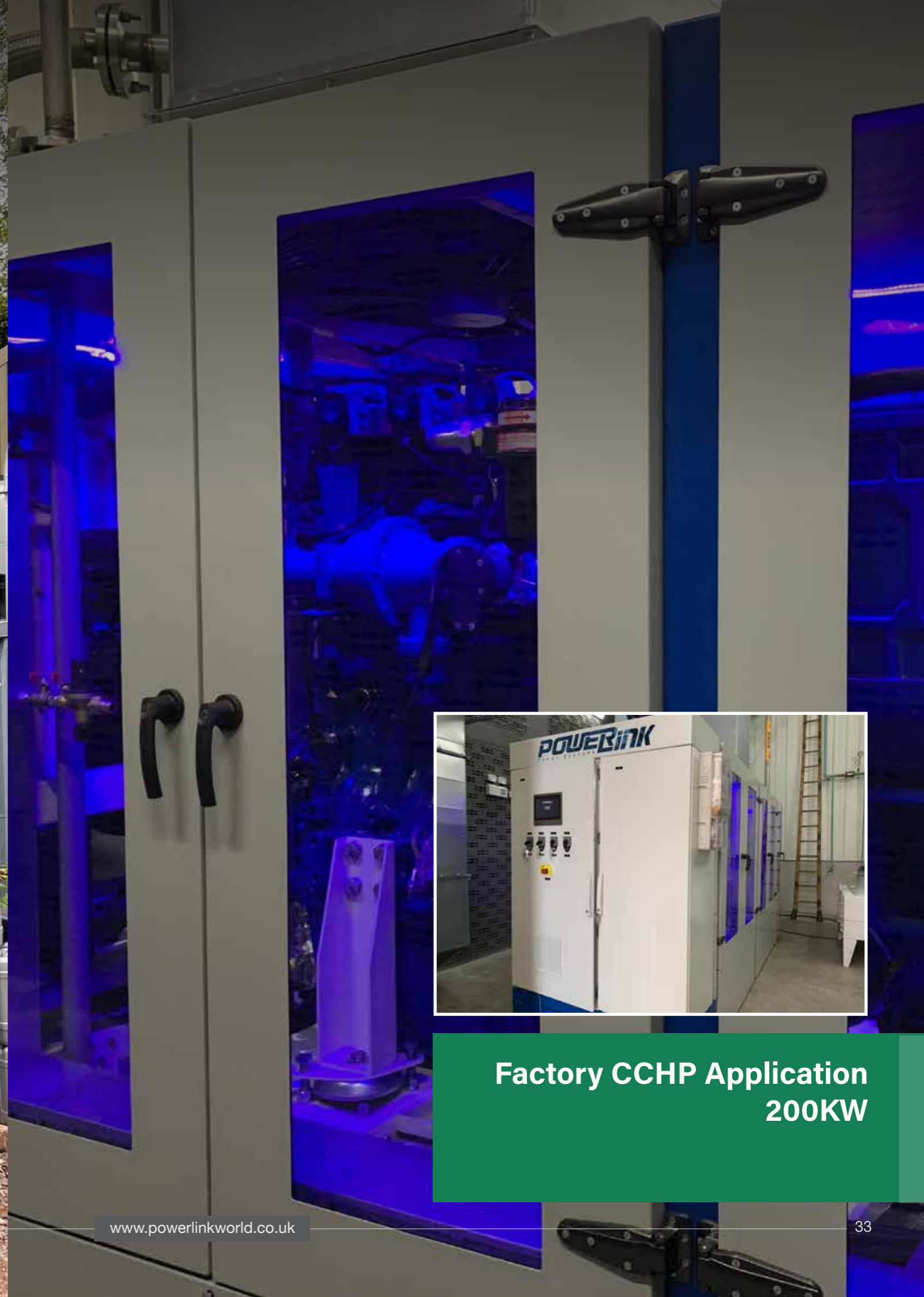
Factory CCHP Application 200KW